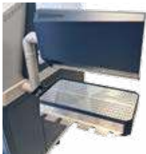
1 Desk & Harness Shelf