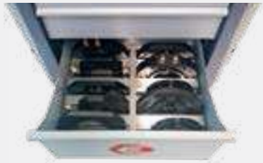
CRp Flange Drawer Organizer (max. 1 pc per trolley)

Ideal workshop organizer to fit most parts of the machine like harnesses, hoses, adapters, tools and flanges. Can be easily transformed to a Cambox and/or pump rack for easy transfer and storing.