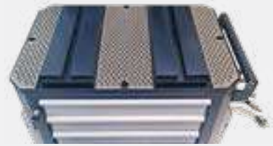
Cambox/Pump Transfer Rack (max. 2 pcs per trolley)