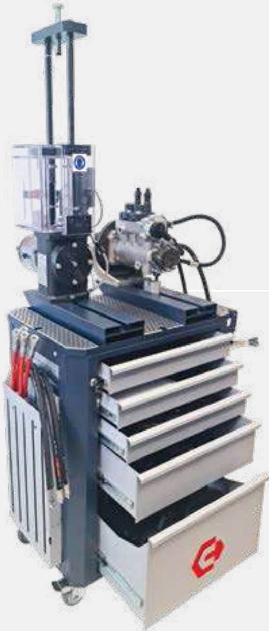
Carbon Zapp Trolley Fully Configured Setup