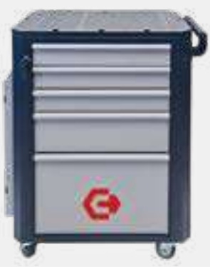
CZ Base Trolley