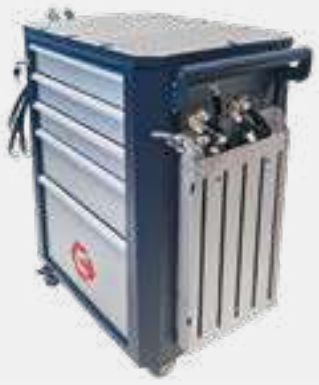
Hose & Harness Side Organizer (max. 2 pcs per trolley)