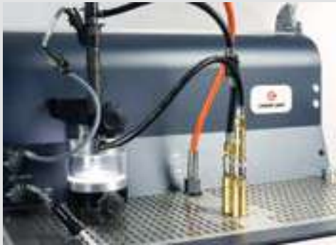
TESTING WITH ILLUMINATED SPRAY CHAMBER.